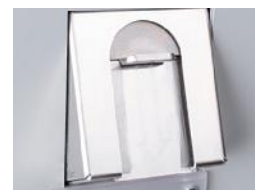
Vandal-proof coin slot