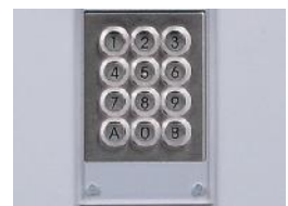
Illuminated keypad protected by 5 mm Lexan sheet