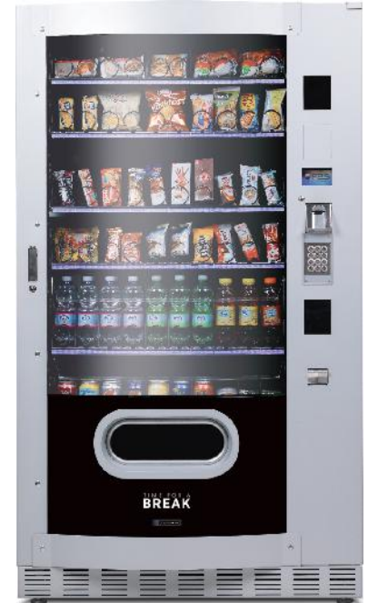
Skudo Max GCD 1050